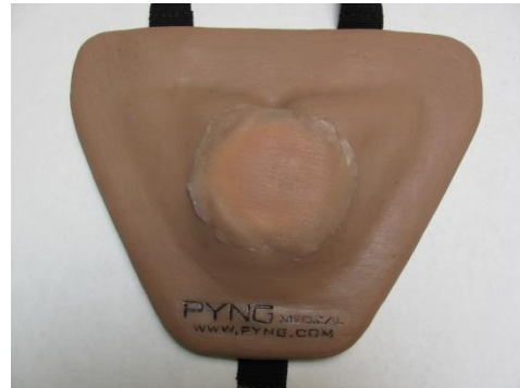
Chest-Matt with puck