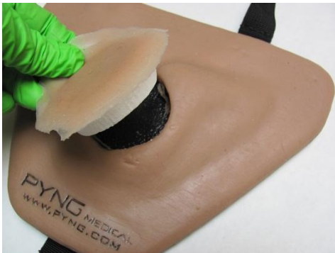
Inserting the puck in the Chest-Matt