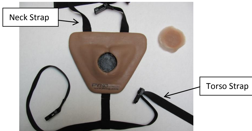
Chest-Matt with replacement puck (illustration only, actual may vary)

The Chest-Matt may also be used as a table top training tool.